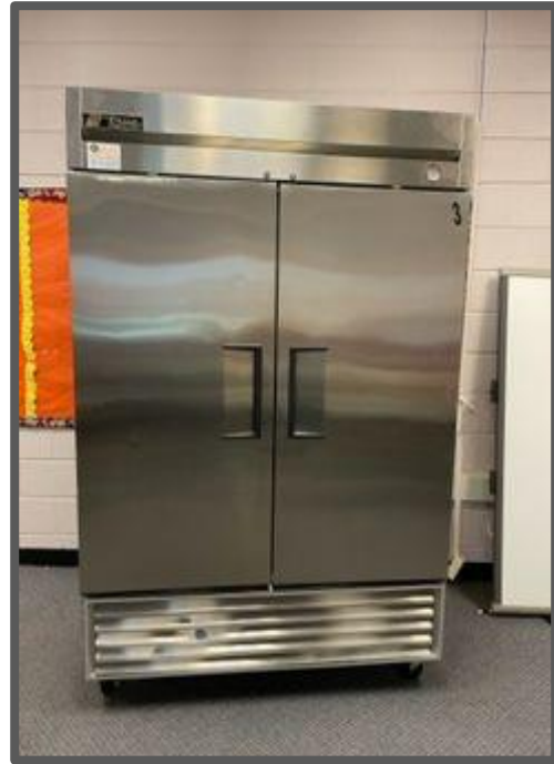
2006 1HP-2 door True Freezer