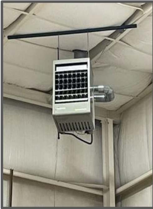
4-Modine 150,000 BTU Gas Unit Heaters. These will be available for pick up mid October. Units will be sold individually.

The Spring Bluff Board of Education has determined the following items are surplus. These items will be sold to the highest bidder. All bids should be submitted to the school office by 3 p.m. 9/14/22 in a sealed envelope including name and amount offered. All items are sold in 'as is' condition. Bids will be opened at the 9/15/22 Board of Education meeting. You do not need to be present at the meeting. Please contact Jeannie Jenkins if you would like to schedule a time to look at the surplus items. 573-457-8302